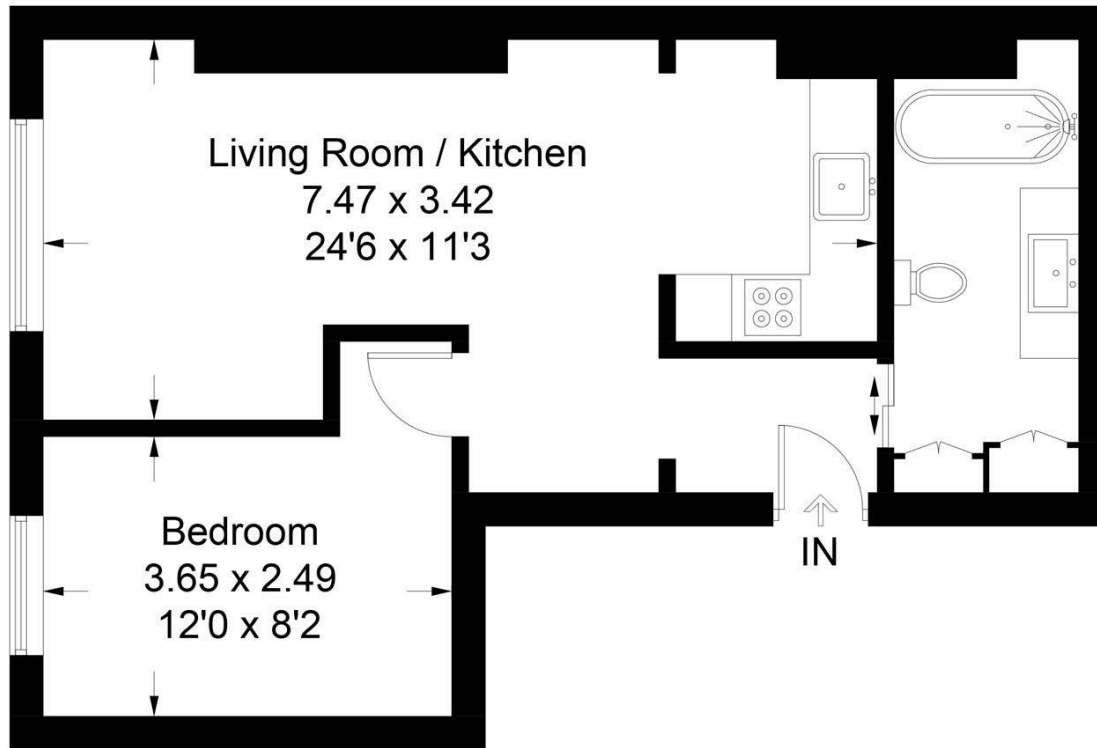
Illustration for identification purposes only, measurements are approximate, not to scale. Fourlabs.co © (ID1298839)

Approximate Gross Internal Area = 44.9 sq m / 483 sq ft